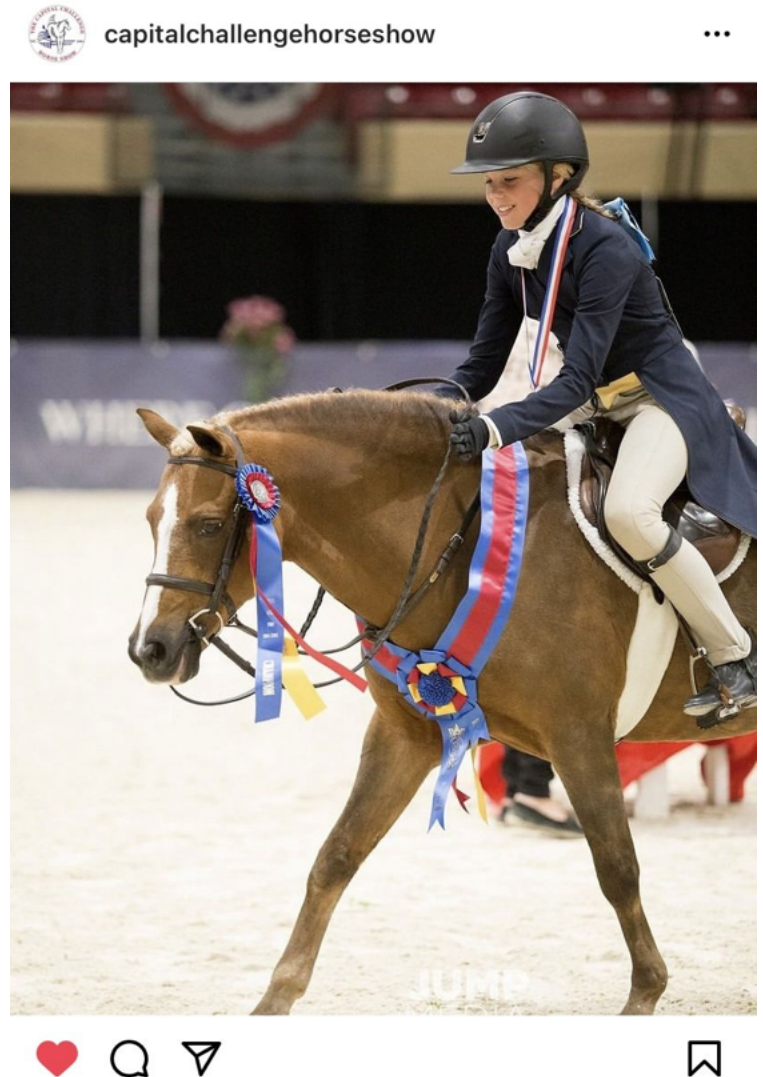
Liked by jumpmediallc and 186 others capitalchallengehorseshow We can't wait for more moments like this during #CCHS2022 e